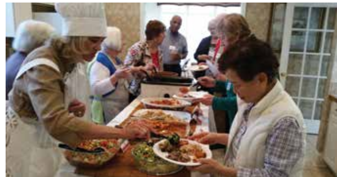
The Orchards of Windward - International Buffet