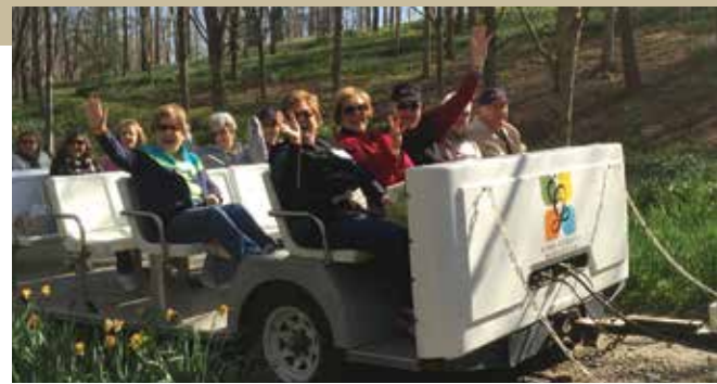
Gibbs Garden Homeowner Day Trip - The Orchards of Stoney Point