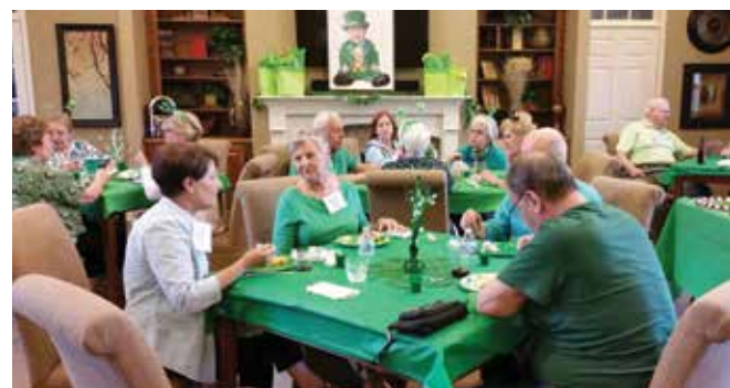
St. Patrick's Day at The Orchards of Stoney Point