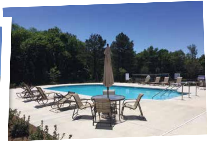
Grand Opening of The Pool and Clubhouse at Big Creek

With the Grand Opening of The Orchards of Big Creek behind us, we are pleased to announce that not only have the first 10 homeowners closed on their new homes, the community Grand Clubhouse and Pool are now in full operation and use as well. Adding to that, we recently completed the 3 Villa Townhome models creating 5 professionally decorated model homes available for touring 7 days a week.