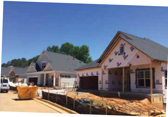
Detached Cottage Condominium Homes at Big Creek