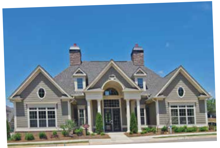
The Grand Clubhouse at Big Creek

The Orchards of Big Creek offers three distinct product lines: