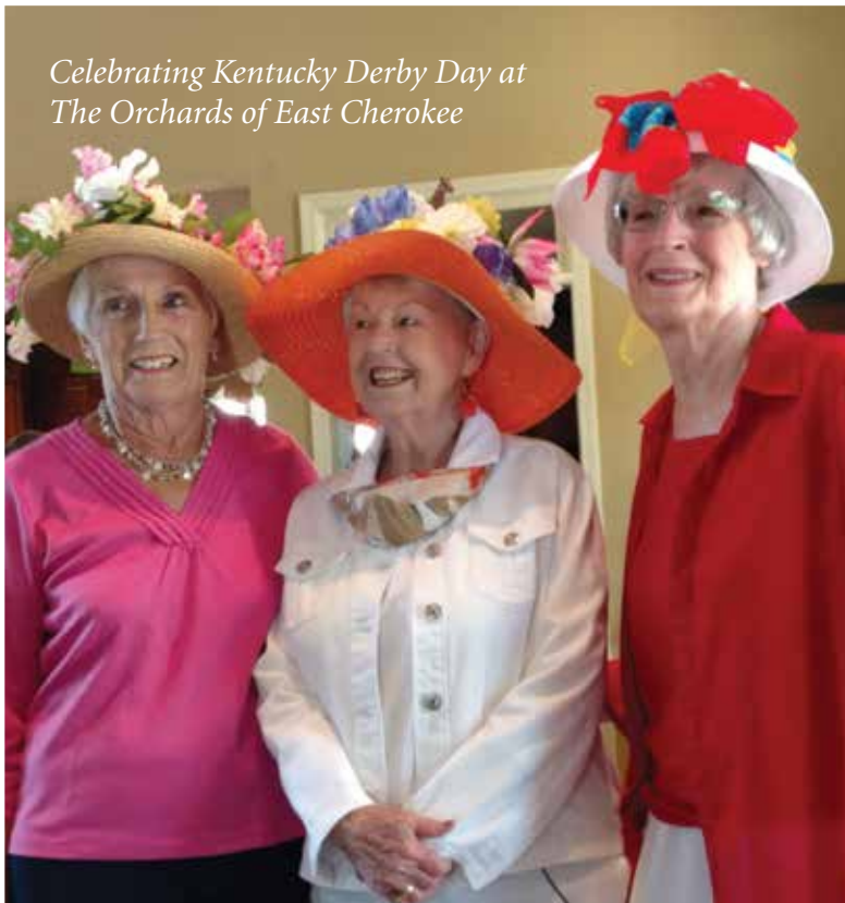
Celebrating Kentucky Derby Day at The Orchards of East Cherokee