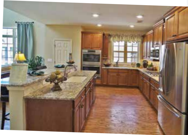
The Birch Townhome Villa