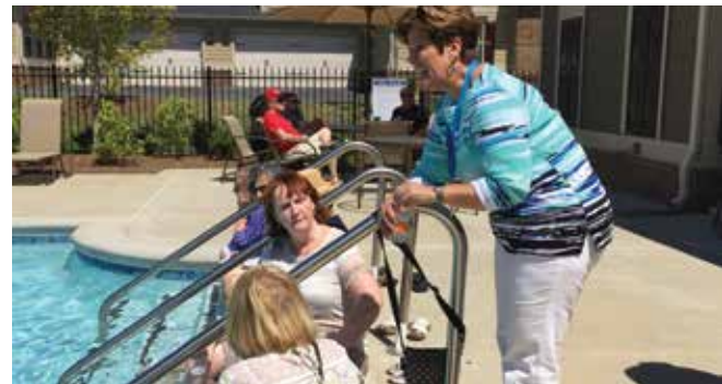
Grand Opening of Pool Season at The Orchards of Stoney Point