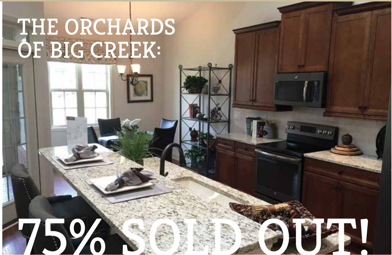
The Dogwood - Kitchen and Breakfast Area

Although our first purchase agreement was written only 13 months ago, we are excited to announce that more than 67 of the homes in the The Orchards of Big Creek (out of 89 total homes upon completion) have already been sold. Additionally, 26 homeowners have already moved in; we are welcoming an average of 7 more each month! The community's Grand Clubhouse and pool (open seasonally) are being enjoyed by our new homeowners, and the social activities are now in place and expanding each month.