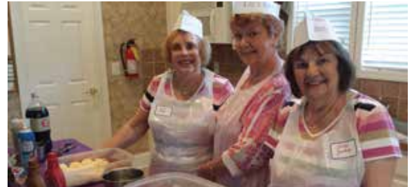
Orchards of Windward Ice Cream Social