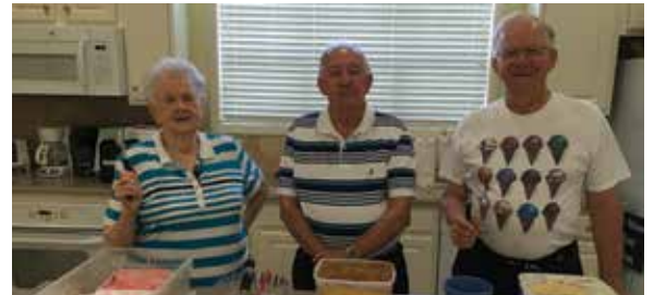
Sweet Apple Ice Cream Social