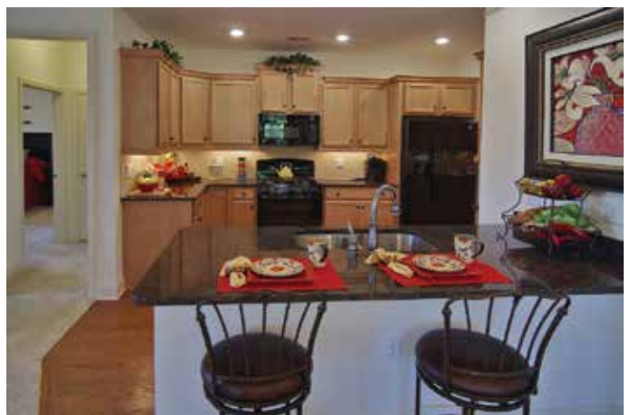
The Ashewood - Kitchen and Breakfast Bar