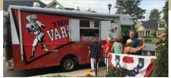
July 4th Varsity Truck Party at East Cherokee