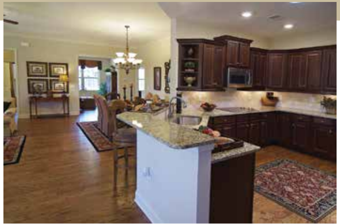
The Charleston - Kitchen and Dining Room