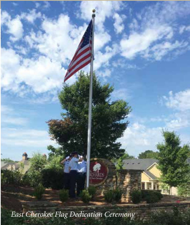
East Cherokee Flag Dedication Ceremony