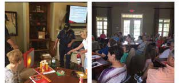
Safety and Vial of Life Presentation at Stoney Point