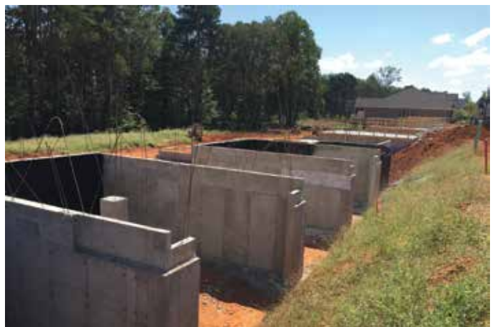
Big Creek - Basements Lined Up for Construction