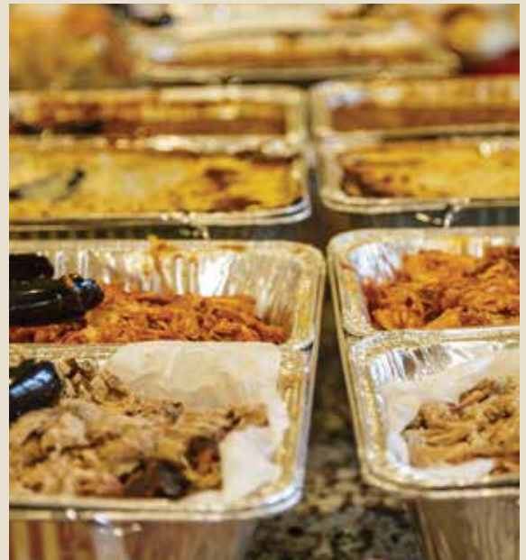
Above Left: Big Creek July 4th Celebration