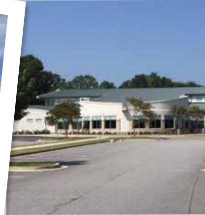
Recreation and Athletic Center at Fowler Park