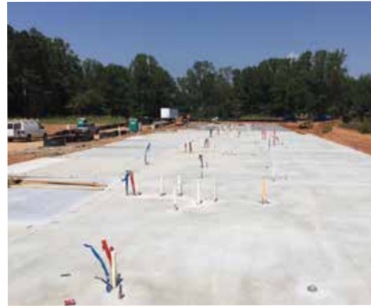
Villa Buildings Ready to go at Stoney Point