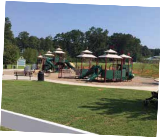
The Playground at Fowler Park