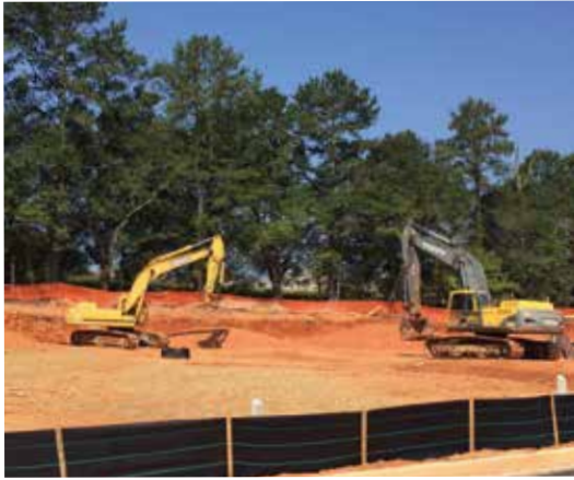
Final site preparations at The Orchards of Big Creek, before construction begins.