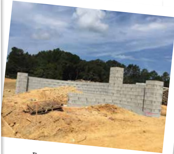
Entry Wall Construction at Big Creek