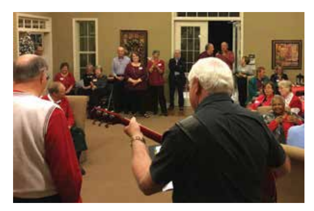
Homeowners turned into musicians at the first annual holiday party at Stoney Point.