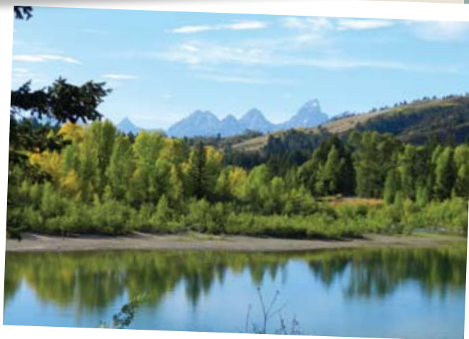
The Grand Tetons