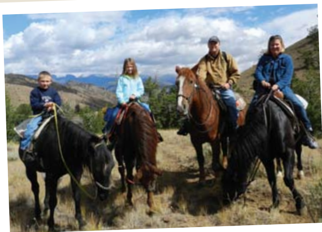
The Wheelus Family in Cody, Wyoming.