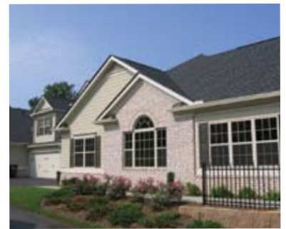
The Orchards of Brannon Oak Farm Ashewood with Sunroom Villa 904