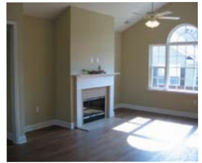
The Orchards of Habersham Grove Hardwoods and Sunshine in Villa 1403

The Orchards of Habersham Grove. 100% BUILT OUT; JUST 2 REMAIN at $199,900! Why settle for less? We now have just two of our most popular Ashewood plans available. One with a tiled screened-in porch and true walk-up storage; the other with a sunroom and true walk-up storage. Many options are included in our super LOW prices. Come take your pick as we expect to be sold out soon. Tour the trademark of all The Orchards neighborhoods: The Grand Clubhouse, which provides the focal point for dinner parties, games and cards nights and so much more. Close to shopping, restaurants, Northside Hospital (Forsyth) and everything else you could ever need and just 1 mile from Ga 400, Exit 14. (Ga. Hwy 20). Call today before it's too late. Sales Information: 678-513-8879