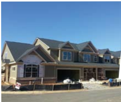
The Arbors Model Homes