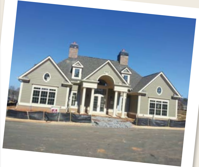
Grand Clubhouse Under Construction