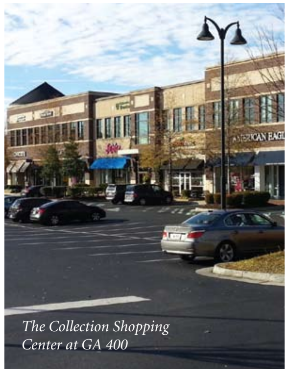
The Collection Shopping Center at GA 400