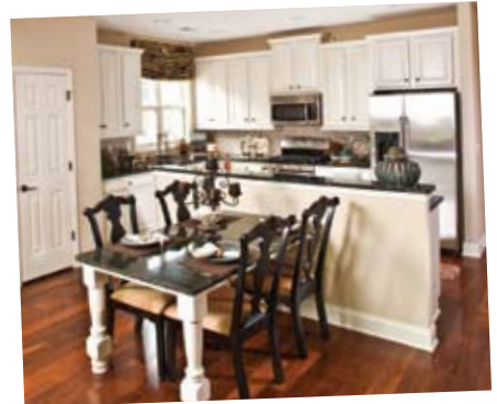
Kitchen in Birch Floorplan