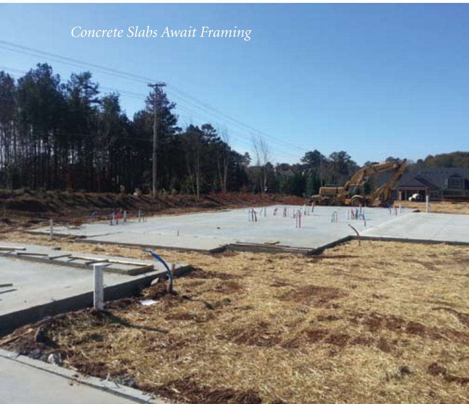
Concrete Slabs Await Framing