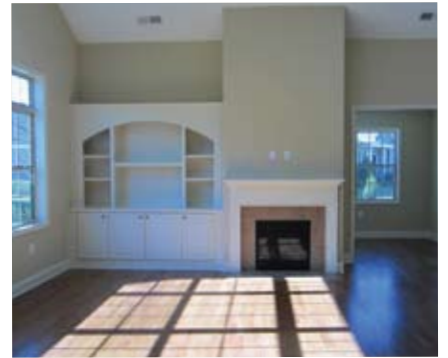
Living Room in Cypress Floorplan