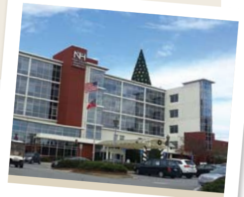
Northside Hospital Forsyth, 10 Minutes Away