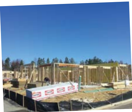
Starting a Ranch Condominium Building