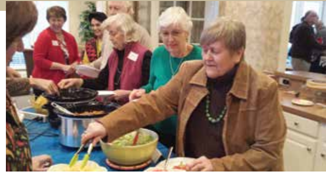
Mexican Fiesta at The Orchards of Windward