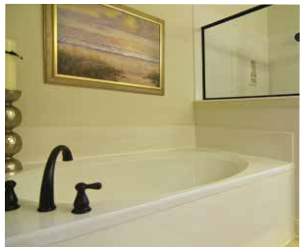
Spa tub option in the Dogwood