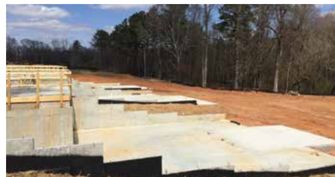
12 Daylight Basement Homesites at Big Creek