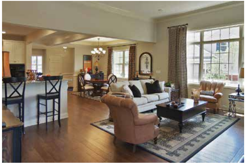
The Cypress Arbors Villa

We are proud to announce the Grand Opening of The Orchards of Big Creek. Notwithstanding Mother Nature having thrown our teams a lot of “wet” curveballs over the past three to four months, our production crew has been very busy building the first phase of homes at The Orchards of Big Creek.