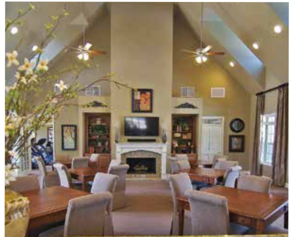
The Grand Clubhouse