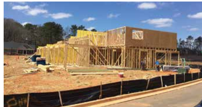
Blue Skies Equal GREAT Building Weather