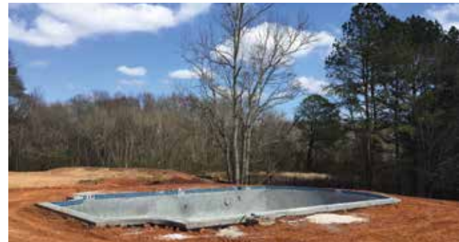
Final Preparation for the Pool at Big Creek