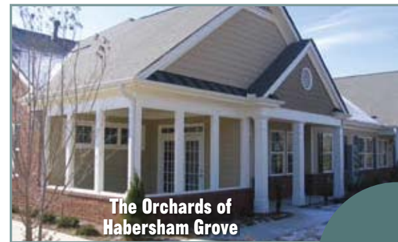
Screened Porch. "The Ashewood."

2. The Orchards of Brannon Oak Farm. BRAND NEW MODEL STARTED! We're very excited to announce the construction of our new Villa model building featuring not only the ever-popular Dogwood plan but also the brand new Cypress plan. This exceptional "end unit" home features a very large dining room with accent columns, extraordinary vaulted living room, gourmet kitchen PLUS a large loft and guest suite upstairs. The second bedroom on the main level has a vaulted ceiling and works well as a guest room, home office or den. You can "Purchase with Confidence" at this flagship neighborhood. Prices range from the $260s – high $300s. 1.5 miles East of GA 400, Exit 13 in Forsyth County. Just 1 mile from The Avenue of Forsyth. Call Deborah or Craig. 678-513-8879.