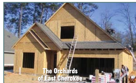
A New Start. Lot 95. "The Ascot with Bonus Room."

3. The Orchards of East Cherokee. BRAND NEW "ASCOT COURTYARD" PLAN WITH BONUS ROOM! You asked for it; we listened and now we're building it. We're excited to announce the construction of this amazing courtyard-style home featuring free flowing spaces, 2 bedrooms on the main level and a bonus room plus full bath upstairs. It's an incredible value! Come visit The Orchards of East Cherokee today and see how this quiet, tree lined neighborhood is still convenient to everything you need. The Orchards of East Cherokee is centrally located between Roswell, Alpharetta, Woodstock and Canton – with the largest Kroger in Cherokee Country located directly across the street. LOW MAINTENANCE GALLERY HOMES and MAINTENANCE-FREE VILLAGE HOMES AWAIT YOUR VISIT. We're right off the intersection of Highway 140 and Hickory Road. Call 770-345-5409.