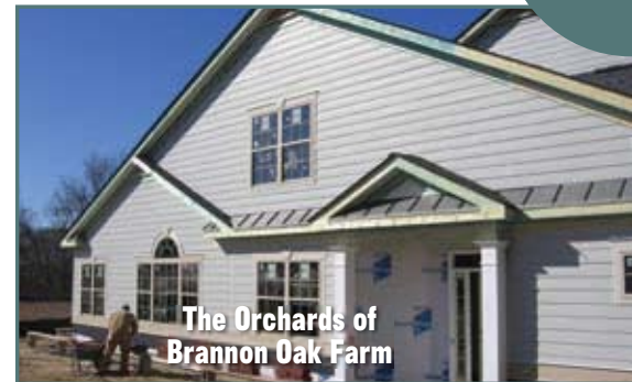
Ready for Brick. "The Cypress" Villa.

3. The Orchards of East Cherokee. BRAND NEW "ASCOT COURTYARD" PLAN WITH BONUS ROOM! You asked for it; we listened and now we're building it. We're excited to announce the construction of this amazing courtyard-style home featuring free flowing spaces, 2 bedrooms on the main level and a bonus room plus full bath upstairs. It's an incredible value! Come visit The Orchards of East Cherokee today and see how this quiet, tree lined neighborhood is still convenient to everything you need. The Orchards of East Cherokee is centrally located between Roswell, Alpharetta, Woodstock and Canton – with the largest Kroger in Cherokee Country located directly across the street. LOW MAINTENANCE GALLERY HOMES and MAINTENANCE-FREE VILLAGE HOMES AWAIT YOUR VISIT. We're right off the intersection of Highway 140 and Hickory Road. Call 770-345-5409.