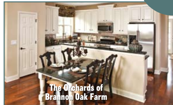
The Orchards of Brannon Oak Farm Gourmet Kitchen in The Birch Villa

3. The Orchards of East Cherokee. NEW COURTYARD FURNISHED MODEL! We have recently completed and professionally furnished our new Belmont courtyard plan on Homesite # 96. Come out to preview this exciting new home featuring two bedrooms plus den, formal dining room, decorative columns, a separate breakfast area and true walk up storage. The Orchards of East Cherokee is located in beautiful historic Hickory Flat and is less than 15 minutes from Roswell, Alpharetta, Woodstock and Canton, making this an ideal location. Easy access to I-575 and the North Georgia mountains. Come out and visit. We have an array of finished, “Ready to Move In” homes in all price ranges and floorplans. Also featuring a limited availability of basement homesites. Model Home: 770-345-5409