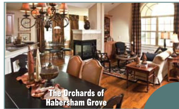
The Orchards of Habersham Grove Spacious Living Room in the Charleston

2. The Orchards of Brannon Oak Farm. ONE-OF-A-KIND VILLAS! If you have been intrigued by one of our “Master on the Main” Villa plans but just don’t need any of the upstairs space, we have a new concept for you. For a limited time we are offering one villa building with our popular Cypressw and Dogwood plans but without any finished space upstairs. This is a great opportunity to enjoy true main level living within a maintenance-free home environment. And if your taste is more oriented toward a single family home, we have several value priced homes ready now. Brannon Oak Farm prices range from the $260s – high $300s. (1.5 miles East of GA 400, Exit 13) in Forsyth County. Just 1 mile from The Avenue of Forsyth. Model Home: 678-513-8879