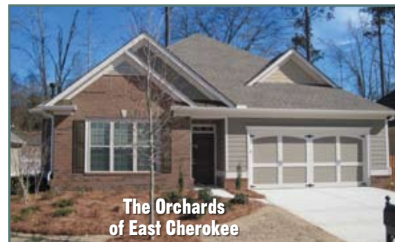
The Orchards of East Cherokee The Elegant “Belmont” Courtyard

3. The Orchards of East Cherokee. NEW COURTYARD FURNISHED MODEL! We have recently completed and professionally furnished our new Belmont courtyard plan on Homesite # 96. Come out to preview this exciting new home featuring two bedrooms plus den, formal dining room, decorative columns, a separate breakfast area and true walk up storage. The Orchards of East Cherokee is located in beautiful historic Hickory Flat and is less than 15 minutes from Roswell, Alpharetta, Woodstock and Canton, making this an ideal location. Easy access to I-575 and the North Georgia mountains. Come out and visit. We have an array of finished, “Ready to Move In” homes in all price ranges and floorplans. Also featuring a limited availability of basement homesites. Model Home: 770-345-5409