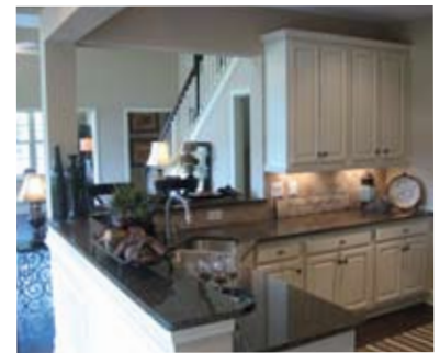
Brannon Oak "The Cypress" Villa