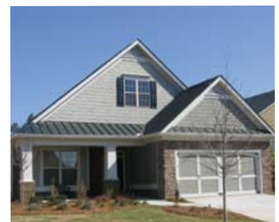
East Cherokee "The Piedmont"

The Orchards of East Cherokee. Another Piedmont! We were so excited with the construction start of our popular "Piedmont" design on homesite # 111 just 10 weeks ago. We are even more excited that it sold prior to completion! As such we are proud to announce that we began another on homesite # 104. The Piedmont plan has rapidly become one of our most popular. Offering a large gourmet kitchen with breakfast bar, a family room complete with beautiful custom built in cabinetry flanking the fireplace, a large "rocking chair" front porch, two very nice sized bedrooms plus large den and screened porch in the rear of the home, this plan has now sold seven times in both our Brannon Oak and East Cherokee communities. Come check it out before it's gone! Model Home: 770-345-5409